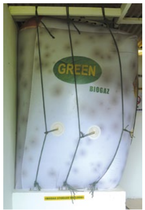
Figure 7. Storage balloon

directly from the cow shed into the collection sump through an underground drainage piping system. A bar screen was installed at the collection sump to prevent the unwanted impurities from entering the inlet chamber that may clog the pump. After that the slurry was channeled into the inlet chamber from the collection sump and left to settle for a specific time until the sediment slurry formed at the base of the inlet chamber. The slurry was pumped into the biogas digester once daily until the biogas digester reached its capacity. The slurry was pumped from the top of the biogas digester in order to avoid the formation of a hard crust that will disturb the process of producing biogas and possibly trap biogas in the slurry. This technique is quite significant because the maintenance cost of the biogas digester can be reduced if there is no formation of a hard crust. This minimises capital cost and the use of electricity as there is no need for a stirrer to operate the plant.