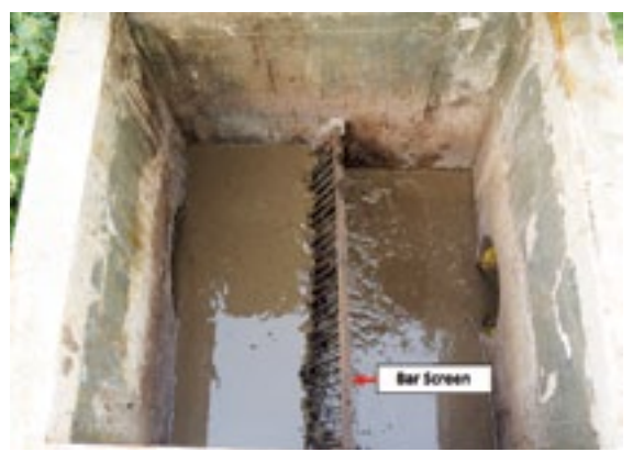
Figure 4. Collection sump