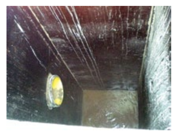
Figure 6. Outlet chamber