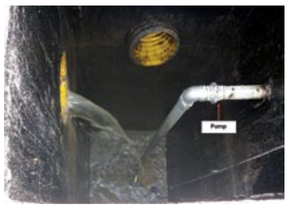
Figure 5. Inlet chamber