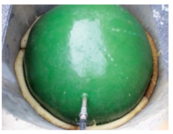
Figure 3. Biogas holder or dome