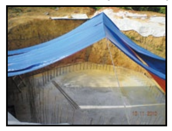
Figure 2. The construction of below ground biogas digester